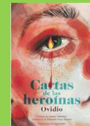
Cartas de las heroínas