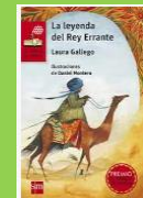
La leyenda del Rey Errante

We are thrilled to announce the arrival of new Spanish books in the S1-S3 library: