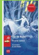
Ojo de Nube