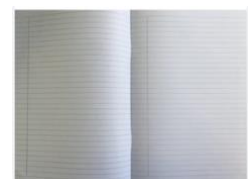
A5 Lined notebook