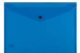
A4 Wallet folder