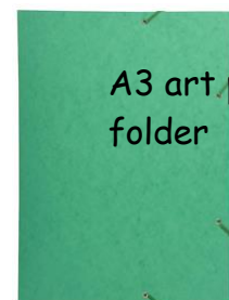
A3 art portfolio/ folder