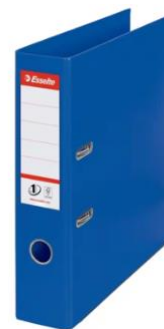
Lever arch folder