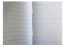
A5 Lined notebook

Indoor shoes/slippers to be worn in class. Cushion for mindfulness/reading corner 2 x boxes of tissues