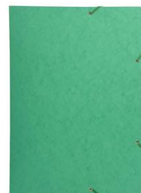
A3 art portfolio/ folder