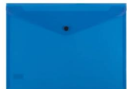
A4 Wallet folder

Indoor shoes/slippers to be worn in class. Cushion for mindfulness/reading corner 2 x boxes of tissues