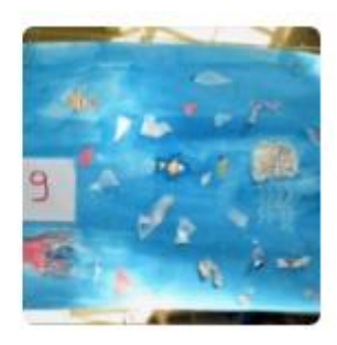
5 candidates will be chosen for each of the 4 categories. When there are more than 5 winners, this is explained by equal points. The winning drawings are presented in numerical order of display.