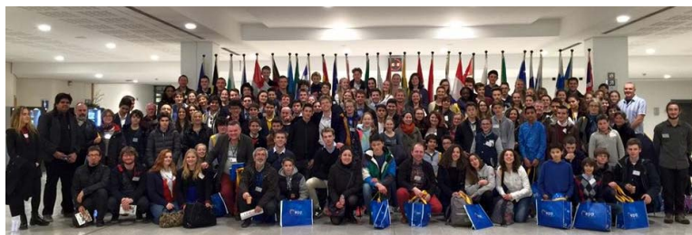
The ESSS 2016 participants

The evaluation of the projects took place in two rounds: the preliminary round involved the analysis of the abstracts and the complete written work produced by the researchers including innovation tips; the second round aimed to integrate newer points into the poster displays. Participating students were competing in senior or junior categories.